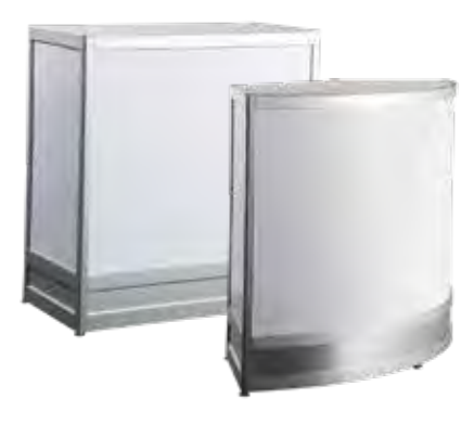
CABINETS | CABINETS