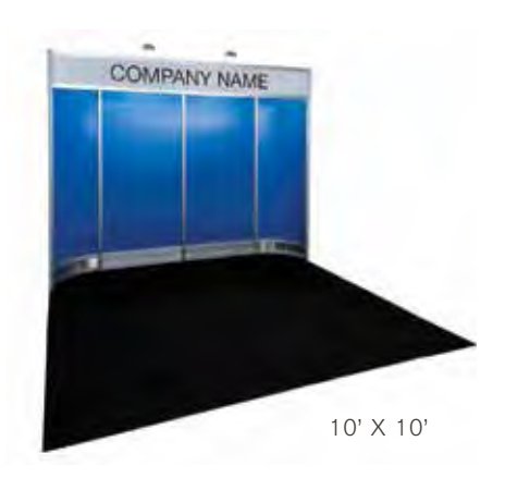
COLOURED PANELS | PANNEAUX COLORÉS