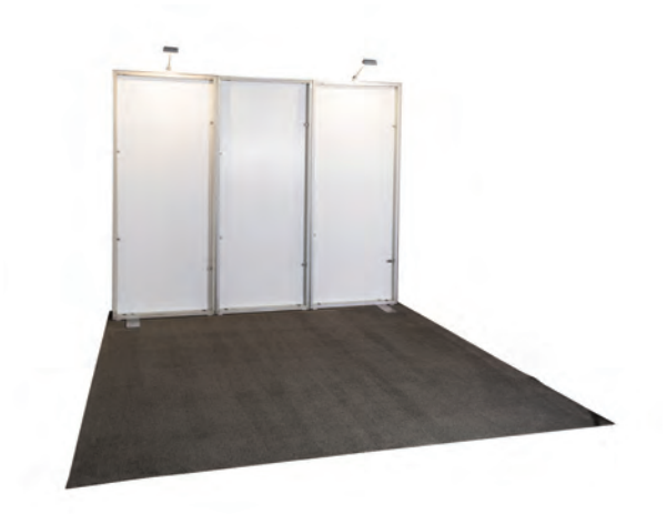
10' x 10' ft. frame cadre 10' x 10'

Cette option est disponible pour les clients qui ont précédemment loué un stand SmartFabric™ et réutilisent maintenant leurs graphiques. Les tissus d'autres sources ne seront pas installés sur ce cadre de location Freeman. Si vous avez besoin que Freeman crée un nouveau graphique, sélectionnez la location de stand SmartFabric.™ Aucun graphique en tissu ne sera fourni sans la location du cadre. En louant votre stand, vous éliminez presque totalement l'empreinte écologique et les émissions de carbone dues au transport. Les stands de Freeman incluent une structure d'aluminium entièrement recyclable.