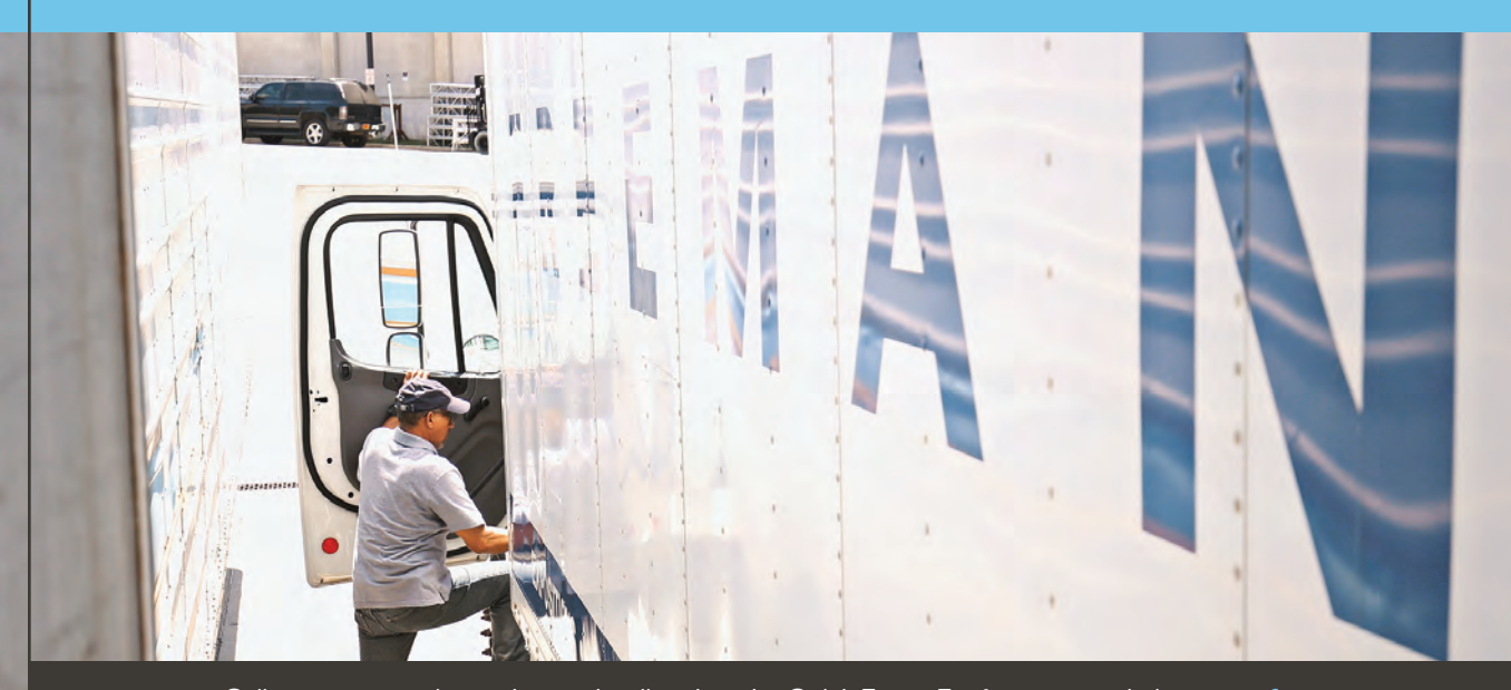
Call customer service at the number listed on the Quick Facts. For fast, easy ordering, go to freeman.com Communiquez avec le service à la clientèle au numéro figurant sur le feuillet Expo en bref. Pour des commandes rapides et faciles, rendez-vous sur freeman.com

Entre nos tarifs forfaitaires et notre service clientèle supérieur, le service de transport des expositions de Freeman est la solution la plus fiable, pratique et rentable qui soit. Notre équipe d'experts a la capacité de rapidement faire face aux changements selon le besoin, demeurant fin prêts à répondre à toutes les conditions de votre événement, quels que soient l'heure et l'endroit.