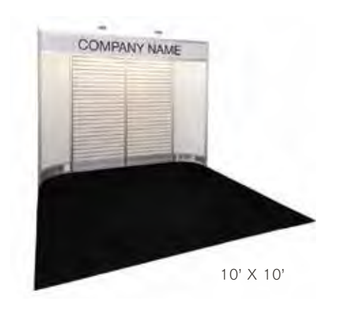
SLATWALL | SLATWALL

Autres options d'amélioration disponibles qui vous permettent de changer les panneaux en slatwall ou d'ajouter des étagères, de changer la couleur du métal et d'ajouter des cabinets comme option d'entreposage avec le double objectif d'un comptoir de réception.