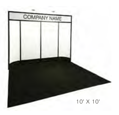
BLACK METAL | MÉTAL NOIR