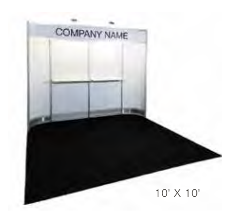
SHELVES | ÉTAGÈRES