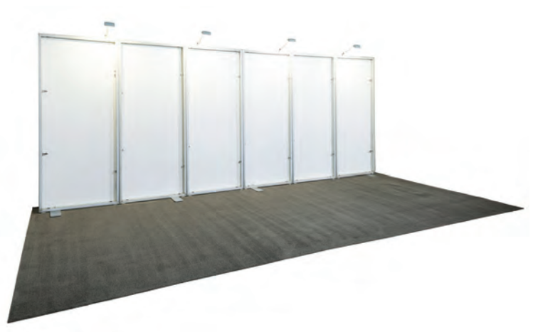
10' x 20' ft. frame cadre 10' x 20'